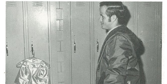
Boy—these baseball uniforms get skimpier every year!!