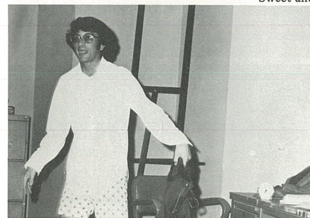
Mr. Gypsy Rose Lee!