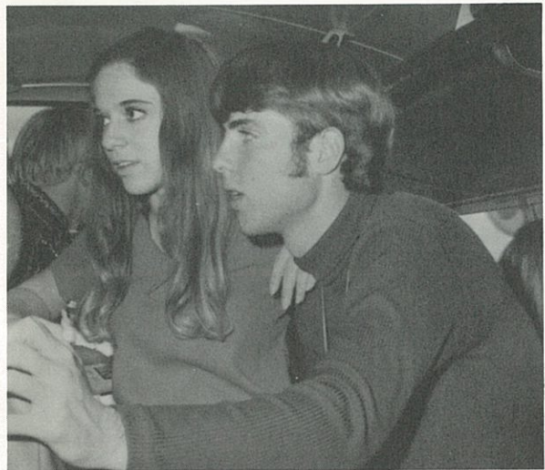
KHS Band trip????????????????