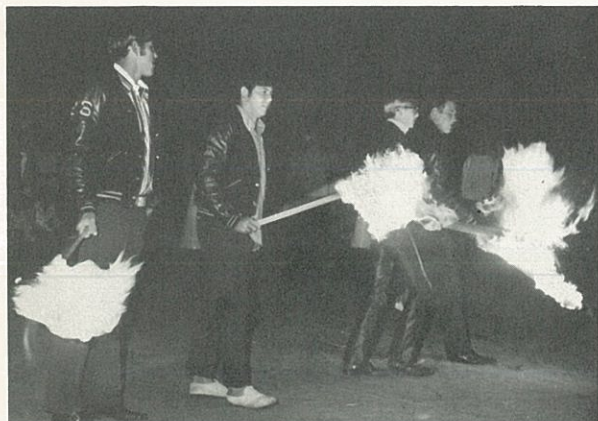
When they're hot, they're hot.