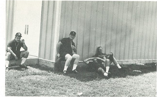
KHS Coaches hard at work (?)