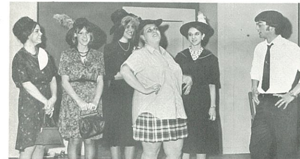
And the winner of the KHS Beauty Pageant is .....