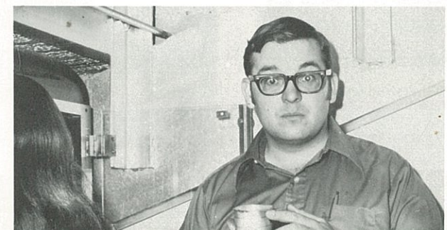
Sweet and Innocent???