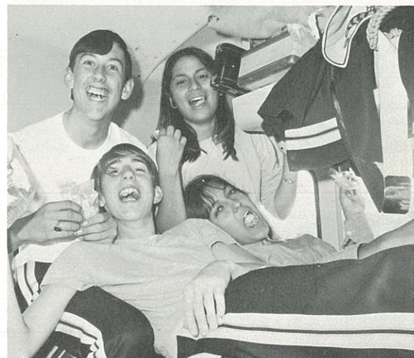
Our group has 25% fewer cavities.